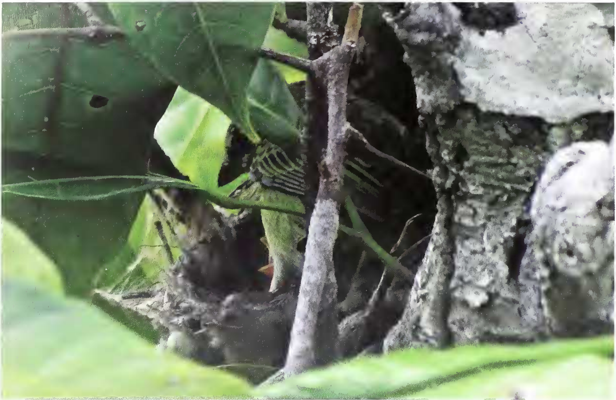
Figure 3. Adult Spotted Tanager Tangara punctata with nestling, Museu da Amazônia, Manaus, Amazonas, Brazil, February 2016

binoculars, at a distance of c.5 m from a platform 2 m above the nest. Once the breeding attempt had finished, the nest was subsequently collected.